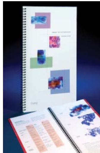
Gynae Morphology Atlas

Q1. Cervical Cytology Squamous Cell Carcinoma (40x)?